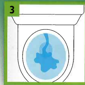
3 If your tank is leaking, the water in the bowl will turn blue.

If you have a leak, The Home Depot and Fluidmaster have the right solution!